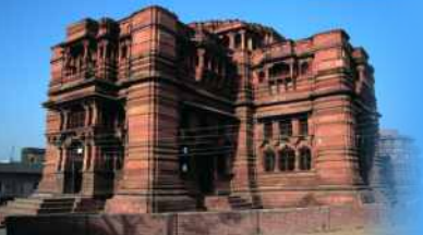
Govind Dev Temple, Vrindavan