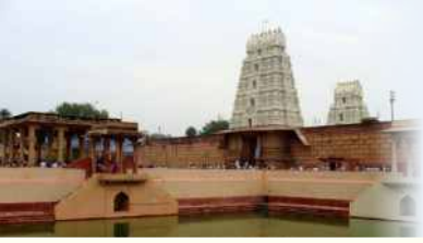
Rangji Temple, Vrindavan