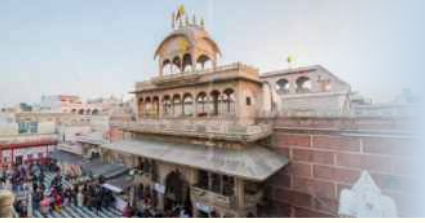
Bankey Bihari Temple, Vrindavan